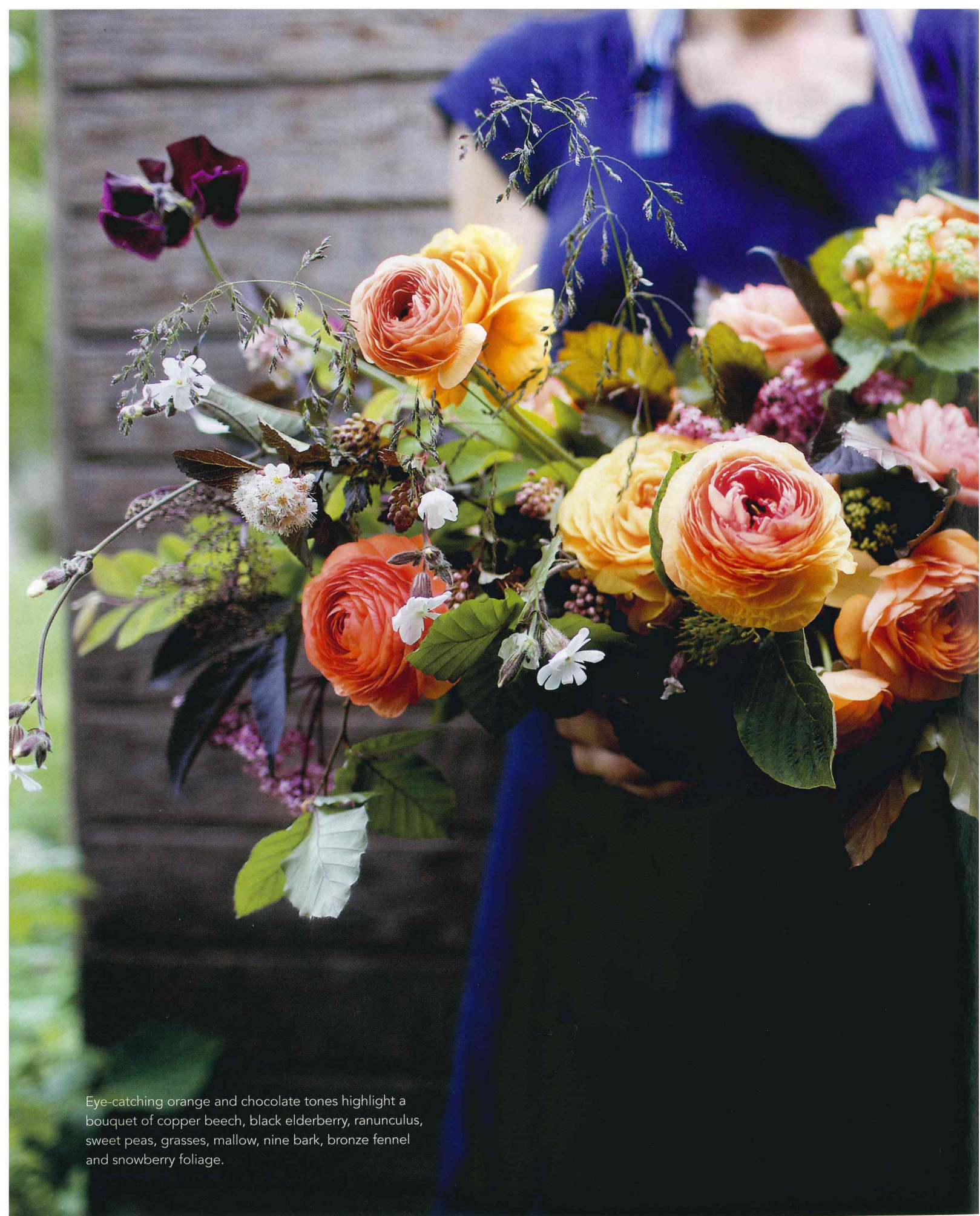
Eye-catching orange and chocolate tones highlight a bouquet of copper beech, black elderberry, ranunculus, sweet peas, grasses, mallow, nine bark, bronze fennel and snowberry foliage.